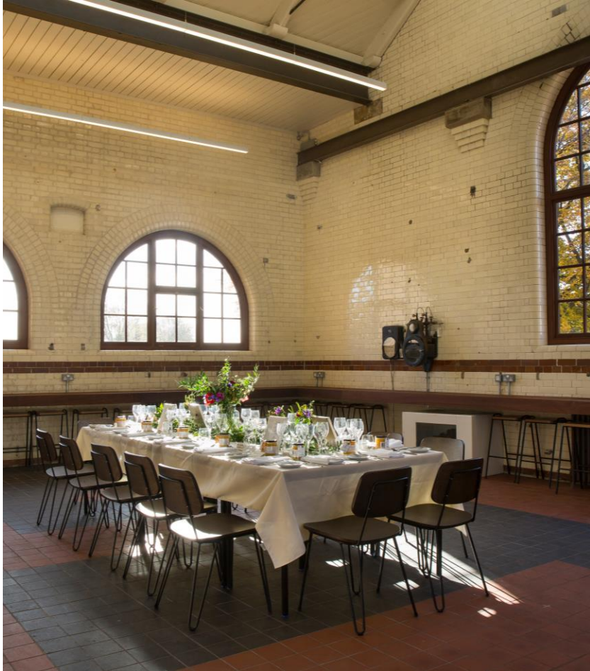
The Turbine Room.