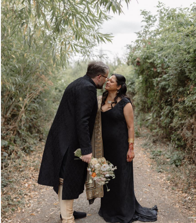
Moments around the reserve.