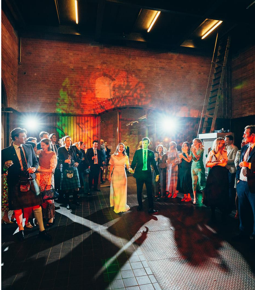
Dancing in the Triple Engine Room.