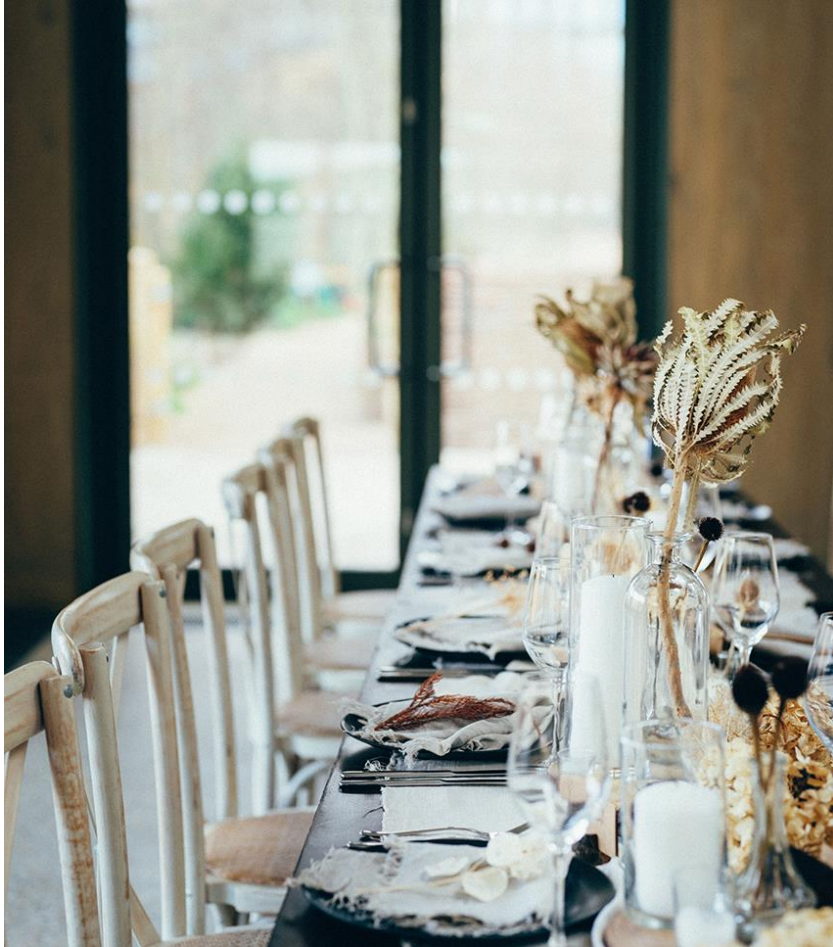
Dining in the Kingfisher Suite.