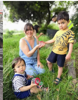
Family bug hunting