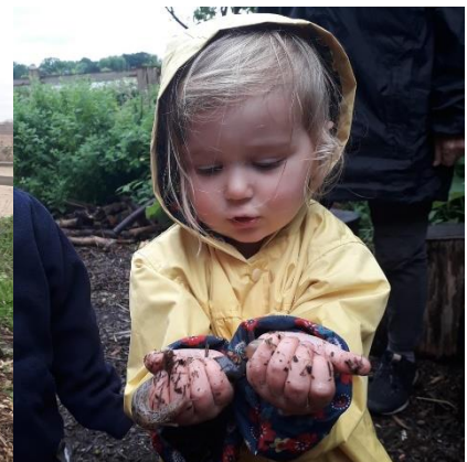
Up close with nature