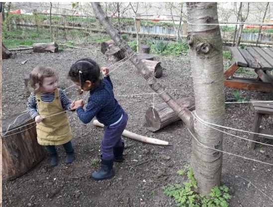
Problem solving with others