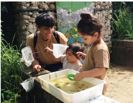
Family pond dipping