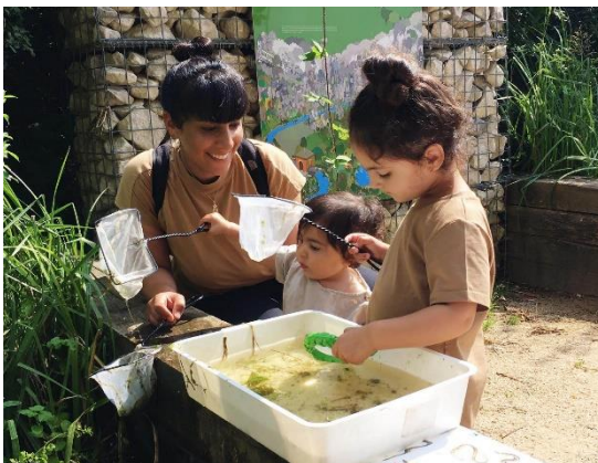
Family pond dipping