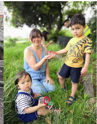
Family bug hunting